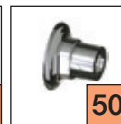
Single Wall Flange