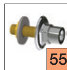
Single Wall Flange with Shank