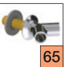
Dual Wall Flange with Shank