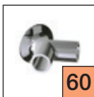
Dual Wall Flange